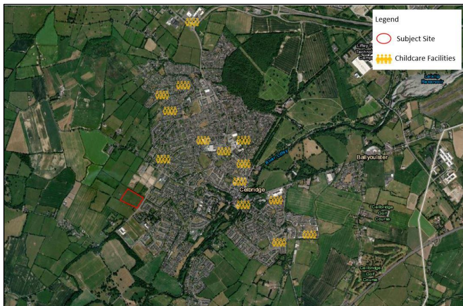
Figure 3: Location of the Childcare facilities (site outlined in red)

Celbridge is located close to major employment areas in Kildare and the wider Dublin region. It is considered reasonable that a sizeable proportion of those commuting to these employment centres may also avail of childcare facilities in these areas. This has been illustrated in the above demographic research and therefore, for the purpose of this preliminary assessment, such facilities have been omitted from the research undertaken. As such, the identified capacity in the area should be viewed as a minimum.