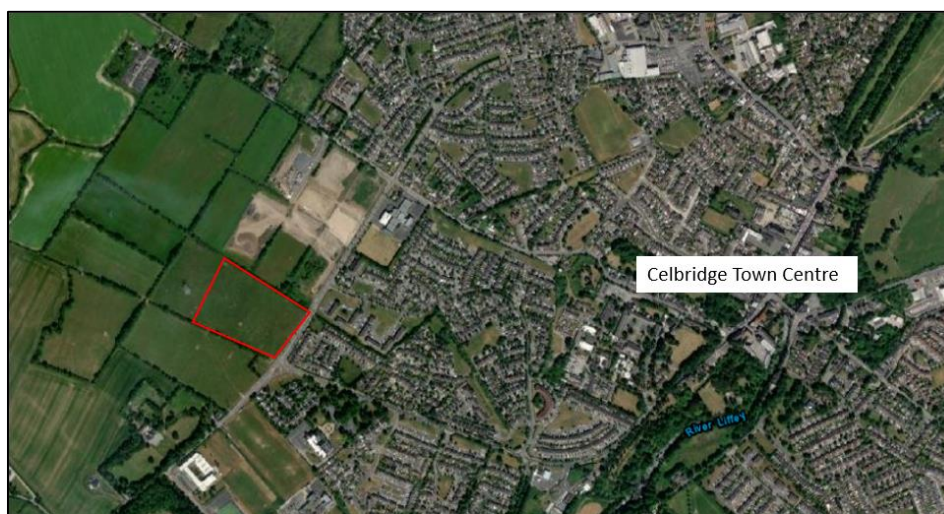
Figure 1: Site Location (site outlined in red)

This report provides details on the current and future capacity of existing and proposed childcare facilities in the area along with the demand for places likely to be generated by the proposed development.