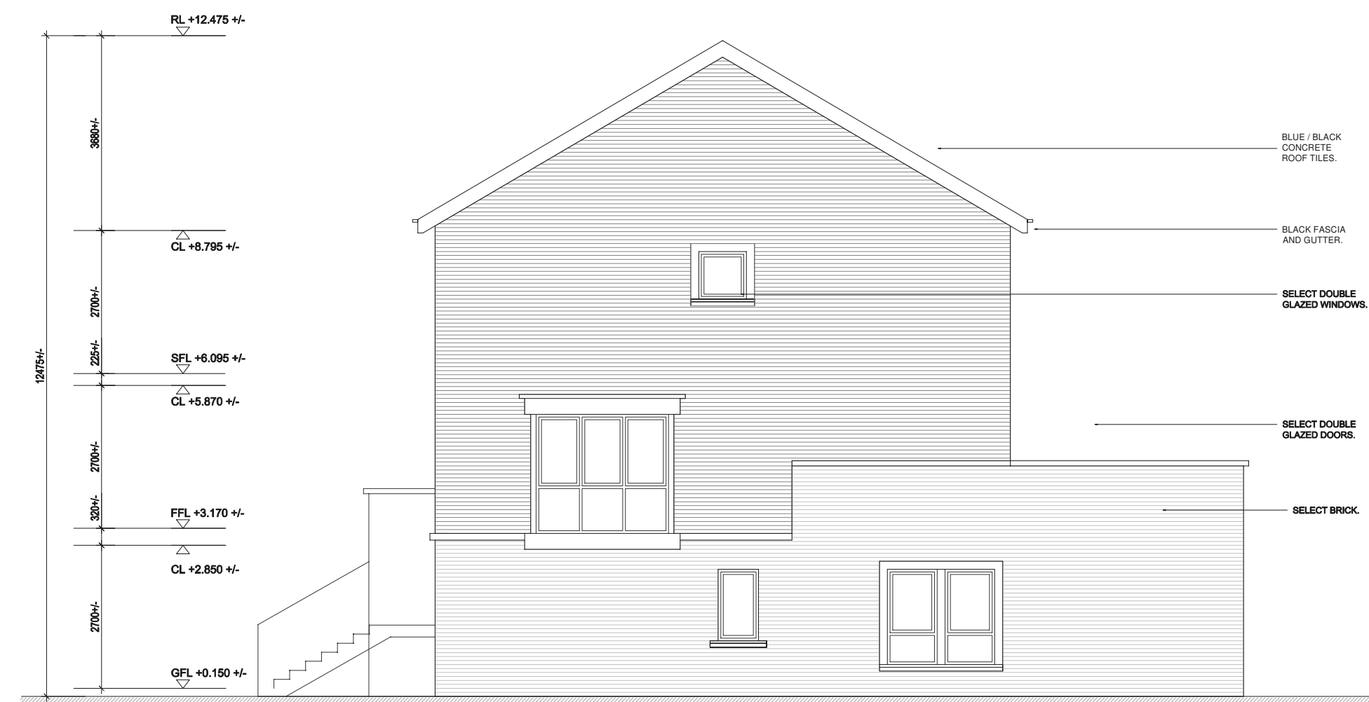
GABLE ELEVATION SCALE 1:100