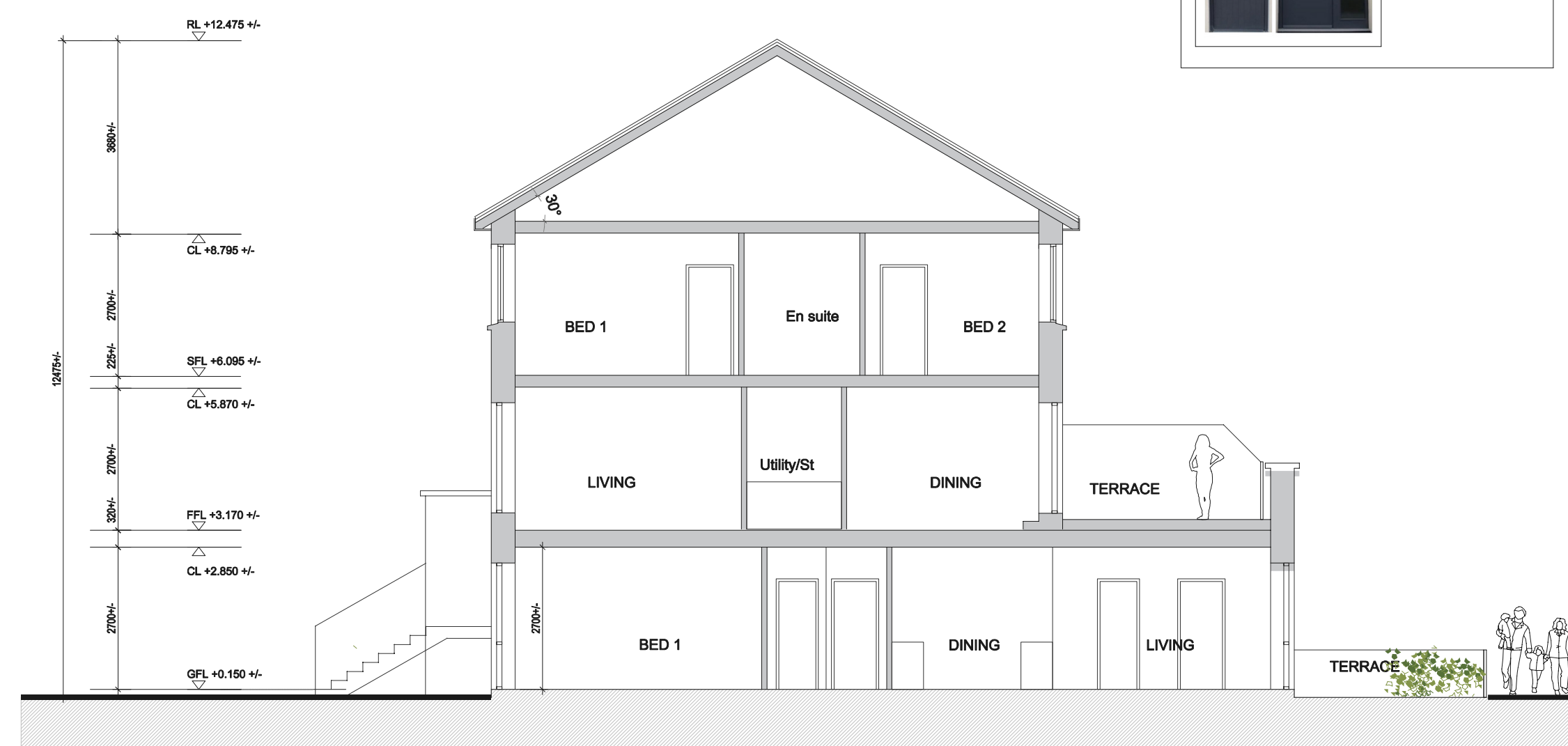
SECTION A-A SCALE 1:100