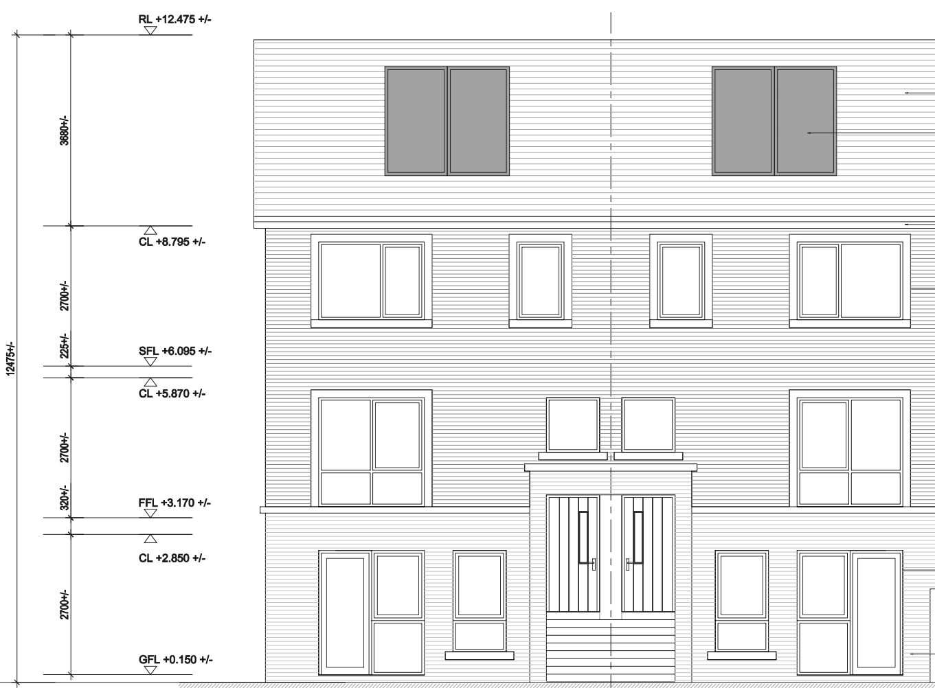
FRONT ELEVATION (SHACKLETON ROAD) SCALE 1:100